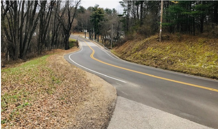
Portion of S. Lowes Creek Road that was repaved

Our Town Road Department and contractors completed road reconstruction projects on S. Lowes Creek Road, Voight Road, Holum Road, Terre Bone Trail, and Fouser Farm Road in 2018. Thank you for your cooperation and patience during right-of-way clearing and road closures to assist us in delivering quality projects!